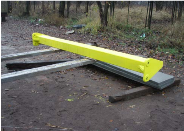
Spreader beam for PCM Module