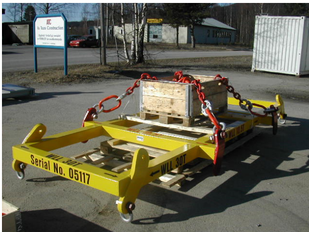
Certified Lifting Frame WLL 30,000 kg