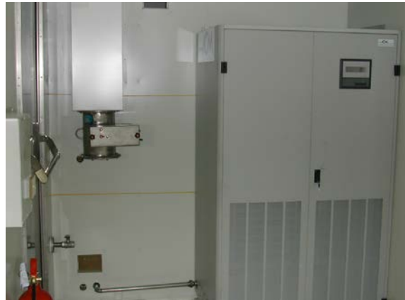
HVAC and VSD Cabinet

Instrumentation included smoke detectors, gas detectors, flow switches, pressure differential switches and temperature transmitters