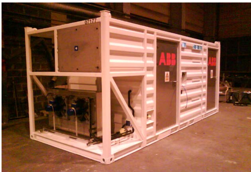
Completed Container, ready for delivery

Instrumentation included smoke detectors, gas detectors, flow switches, pressure differential switches and temperature transmitters