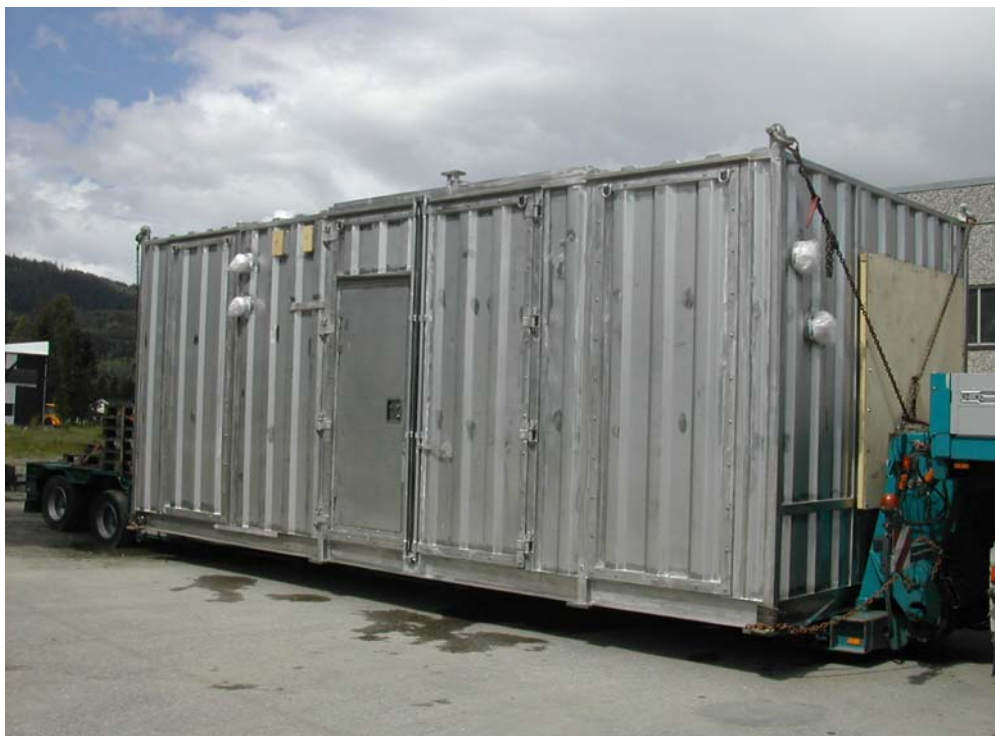
Completed container loaded onto transport ready for delivery to client