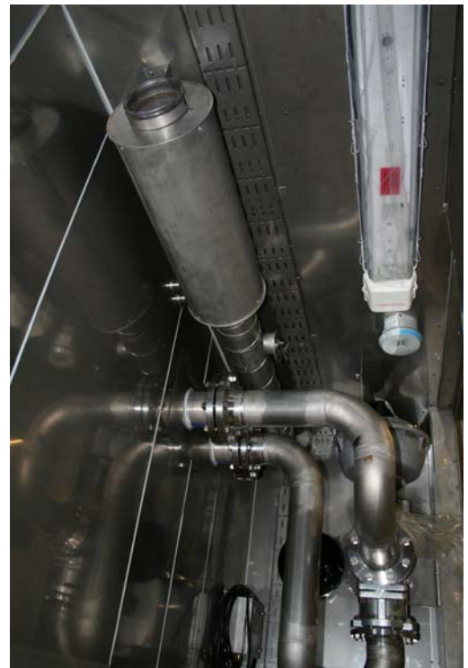
Internal corridor, piping and vent supply.

Lighting, smoke and gas detection, loud Speaker system and alarms was also part of the supply.