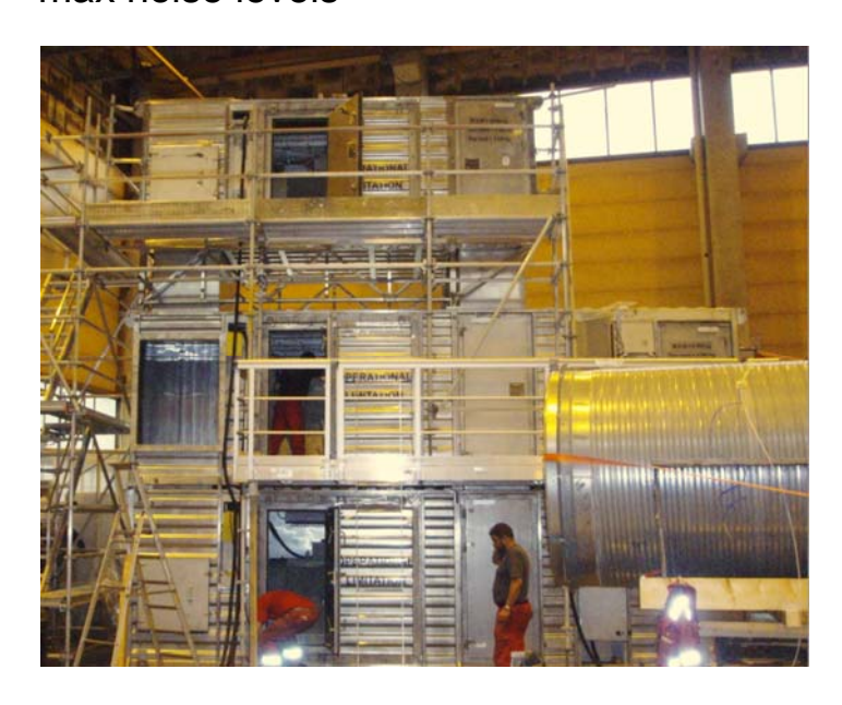
Installation at workshop, nearing completion

After completion, the complete Air Handling Unit was full performance tested to ensure it met the acceptance criteria with respect to air volume, pressure and max noise levels