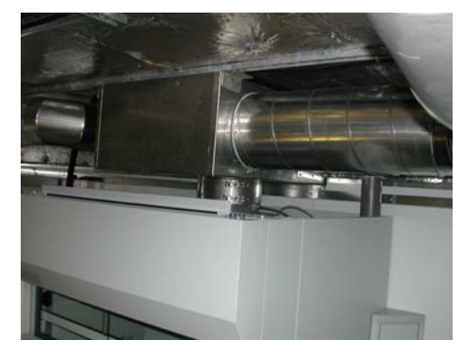
Extract ductwork from the fume cabinet

Interface to the platform HVAC system was via fire dampers on the room, all internal ductwork, dampers etc was also part of ATC's supply.