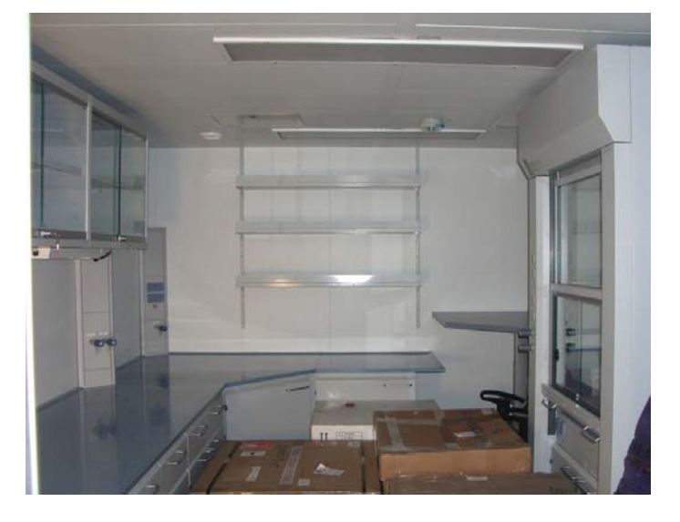
Internal outfitting of the Laboratory module