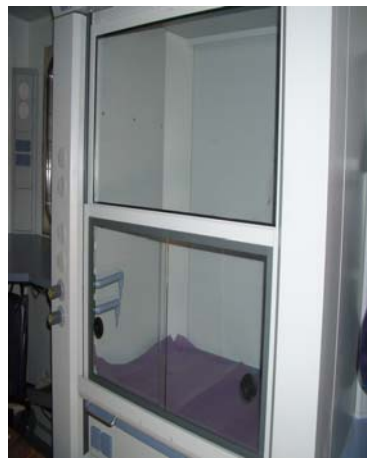
Fume extract cabinet

All hook up from the platform supply was via the Junction boxes on the outside wall of the container.