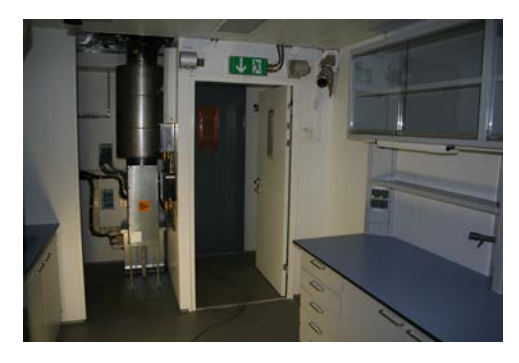
Internal door into air lock

A challenging project which showed the wide range of services that ATC are able to provide