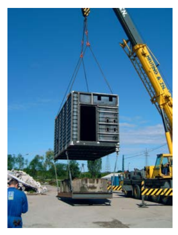
DNV lifting test

The scope included a fully equipped switchboard for all 400/230V consumers, including distribution to normal and emergency lighting.