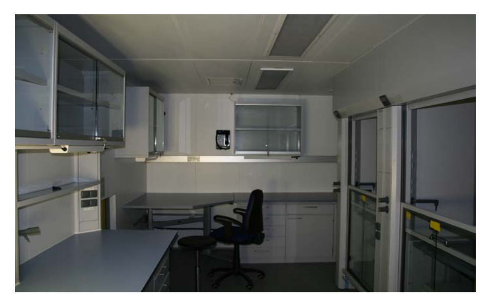
Internal outfitting of the Laboratory module